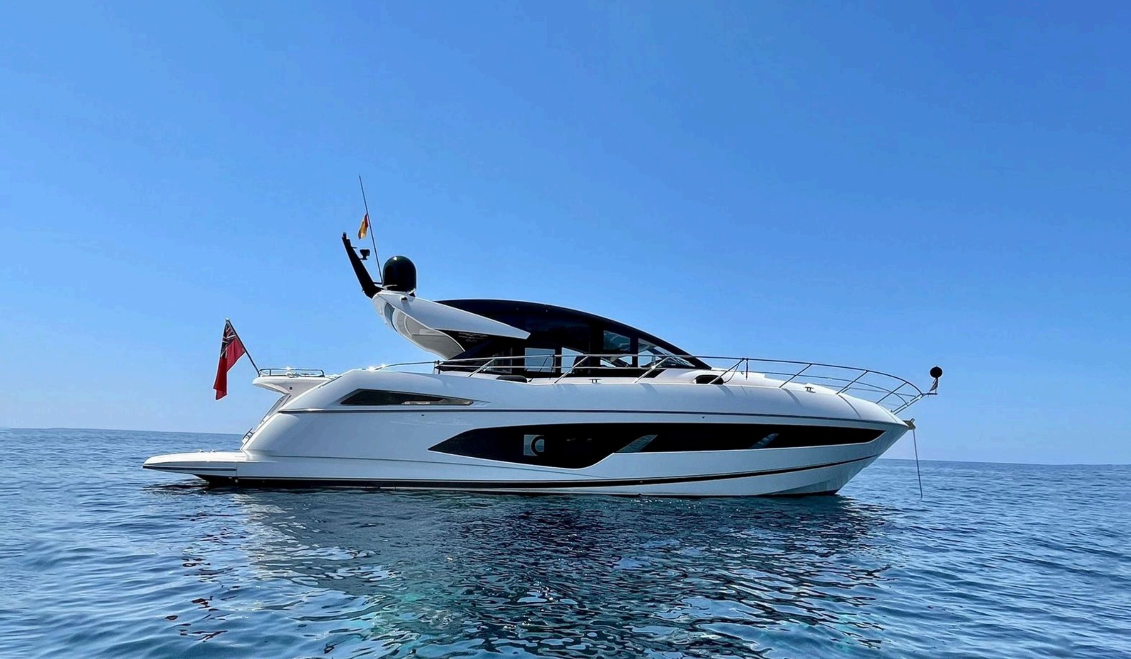
Sunseeker Predator 60 Evo - *HALEY JANE £ 1,395,000 GBP Ex Tax